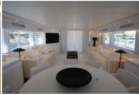
Interior Dining, saloon