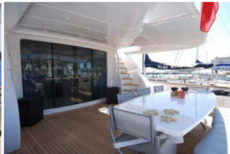
Aft deck view