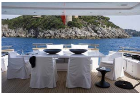
Aft Deck lunch

Tenders + toys: 4.7m tender with 90 hp outboard engine 2 Yamaha jetskis (1 for 3 pax) Water skis Snorkeling equipment Bananas, inflatable canoe for 2 Playstation