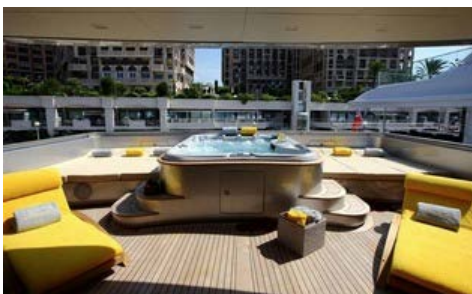
Upper aft deck