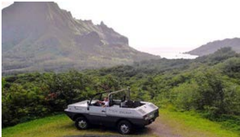
Amphibious Jeep on land