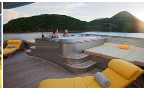
Upper aft deck jacuzzi