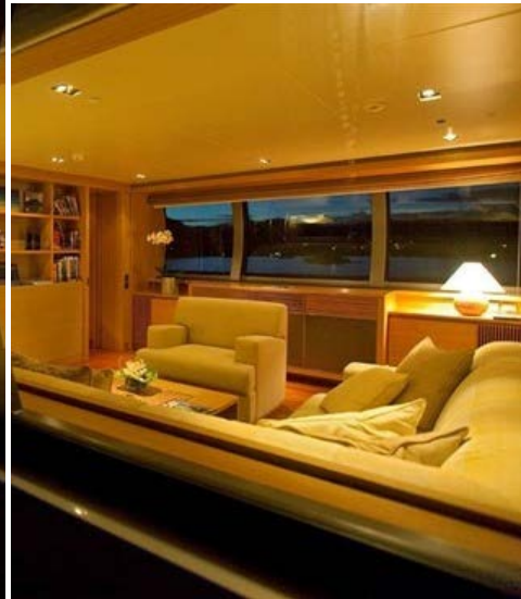
In & Out upper deck lounge #2