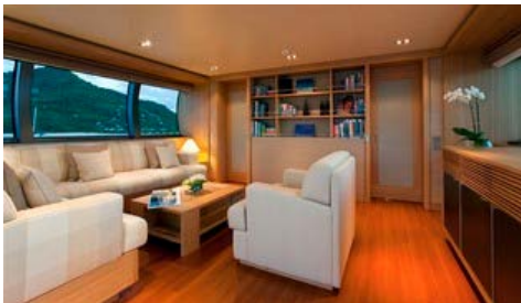
Upper deck lounge from aft