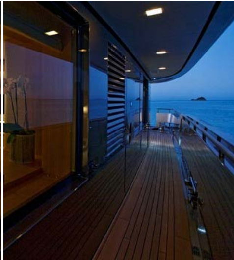
Dining room In & Out #2