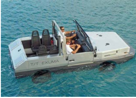
Amphibious Jeep at sea