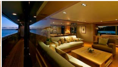
Main salon by night