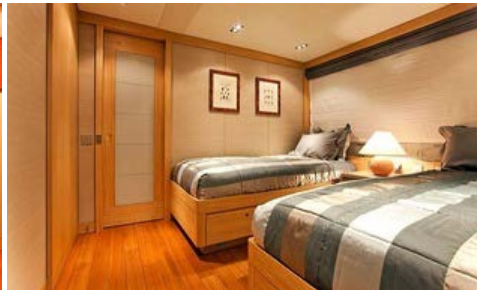
Guest twin cabin