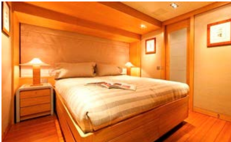
Guest queen cabin