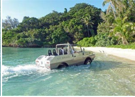
Amphibious Jeep landing