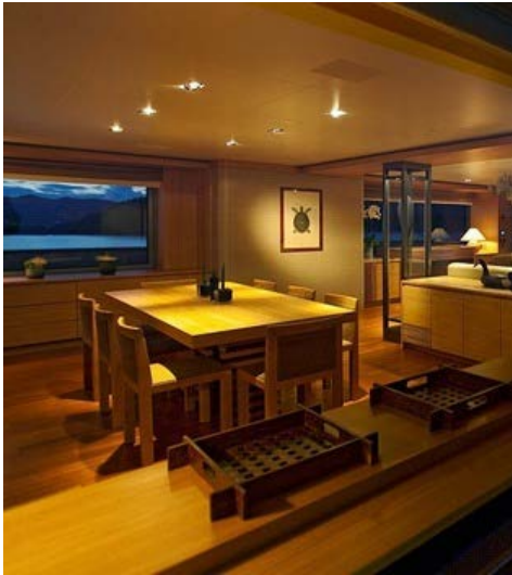
Dining room In & Out #1