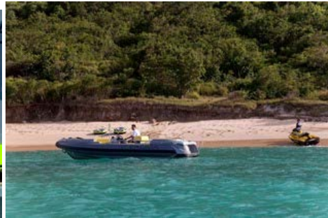
Tender & toys