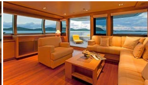
Upper deck lounge