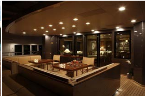
Al fresco dining