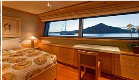
Main deck guest cabin