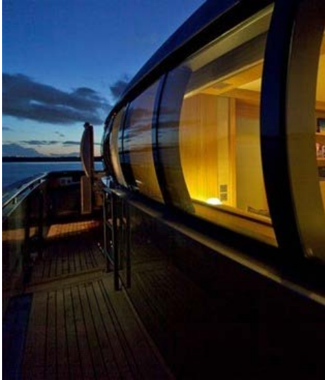
In & Out upper deck lounge #1