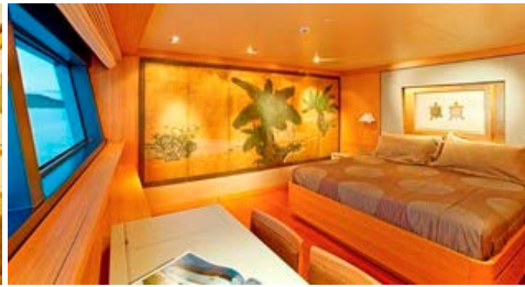
Master stateroom from starboard